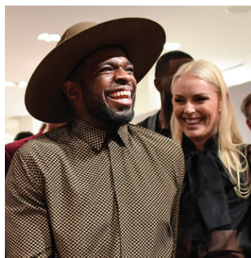
PK Subban and future wife, US skier Lindsey Vonn, at Holt Renfrew fundraiser.